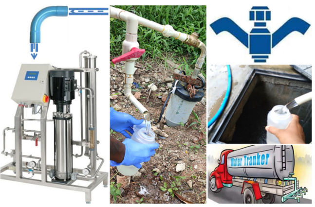
Figure 1: Dialysis-medical Reverse Osmosis (RO) system – Feed water Tests (DRF)

used in dialysis. In other words, a good & fully functional RO system that removes a wide range of contaminants & minerals, is an important indicator of safe dialysis water. Considering the high volume of RO water consumed by dialysis centres, many hospitals and almost all dialysis centres have in house RO plants. Raw water for dialysis-medical RO plants may be sourced from borewells in campus, municipal water and/or tanker water.